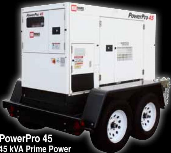
PowerPro 45 45 kVA Prime Power Tier 4 Isuzu Diesel Engine