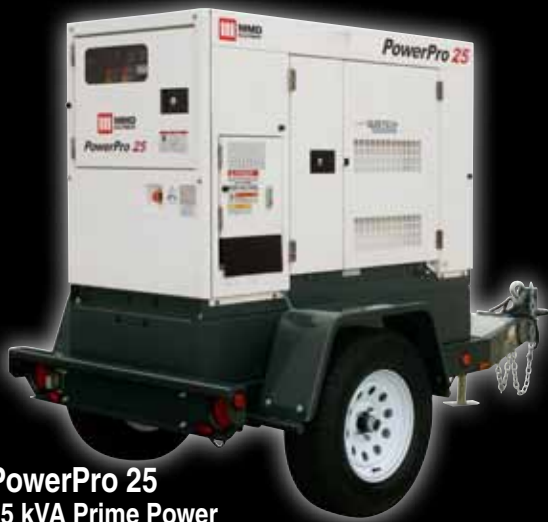
PowerPro 25 25 kVA Prime Power Tier 4 Isuzu Diesel Engine