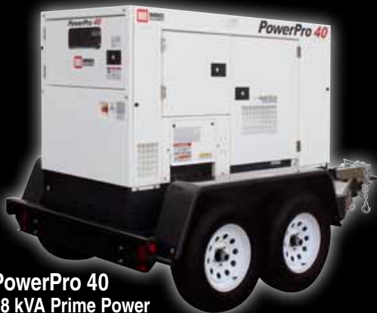
PowerPro 40 38 kVA Prime Power Interim Tier 4 Kubota Diesel Engine