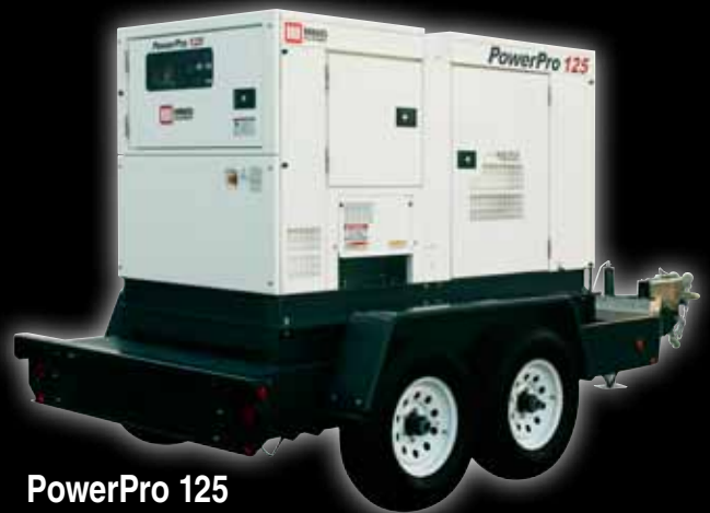
PowerPro 125 125 kVA Prime Power Tier 3 Flex Isuzu Diesel Engine