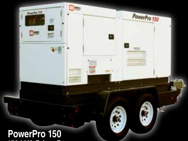
PowerPro 150 150 kVA Prime Power Tier 3 Flex Isuzu Diesel Engine