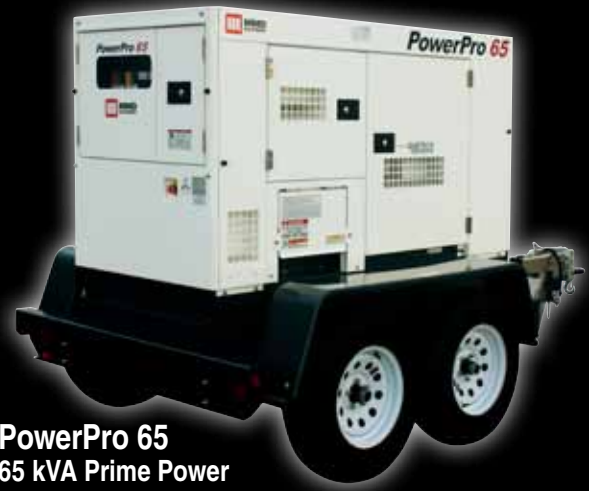
PowerPro 65 65 kVA Prime Power Interim Tier 4 Kubota Diesel Engine