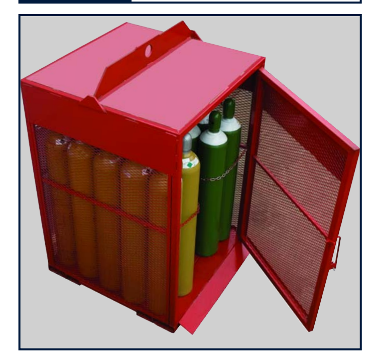
Cylinder Comparison (Airgas models shown)