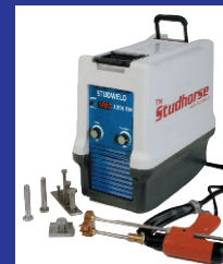
Studhorse 1000DM & 1200DM Stud Welders