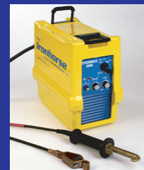
Ironhorse 300S 700V DC Input