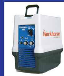
Workhorse 300S Stick/Lift Start TIG