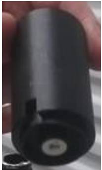
Vent Valve Tool 5555

Use TTC Vent Valve installation tool to install supplied Vent Valve.