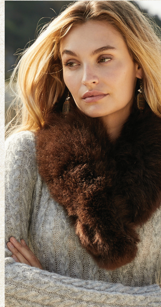
Alpaca Fur Pull-Through Scarf $99