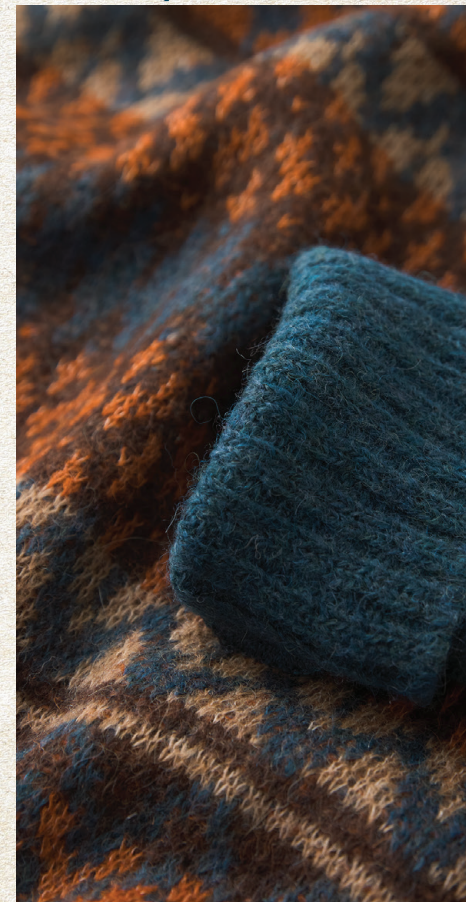
Marlene Coat $998