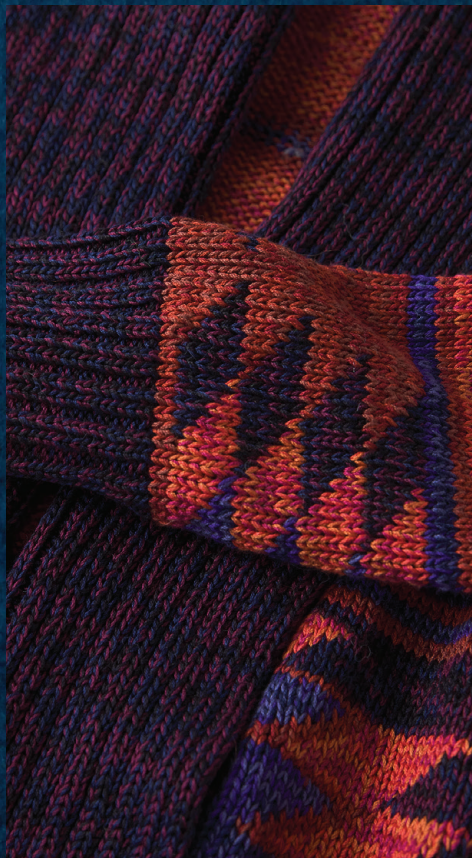
Dhurrie Cardigan $598

Verbier Pullover $295, Verbier Hat $99, Verbier Legwarmers $139