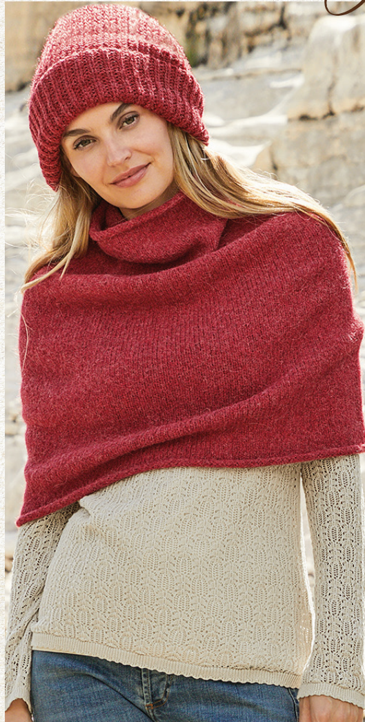
Tillamook Capelet $139, Tillamook Ribbed Beanie $79