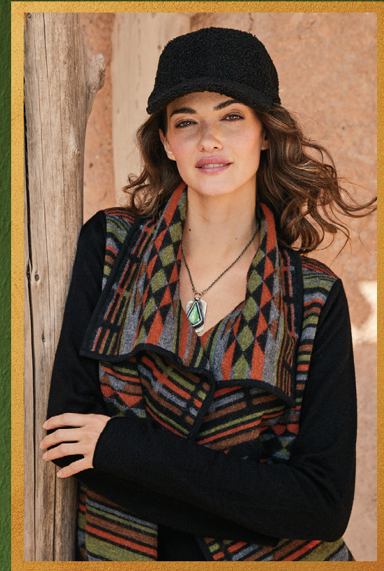
Oulad Knit Jacket $299 Spa Leggings $88 Sherpa Cap $69