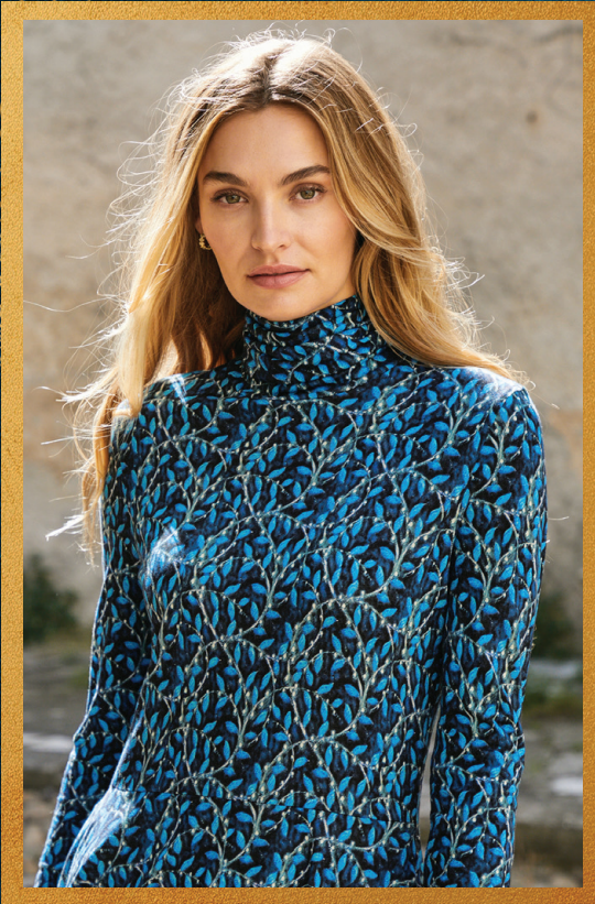
Vining Ariana Dress $199