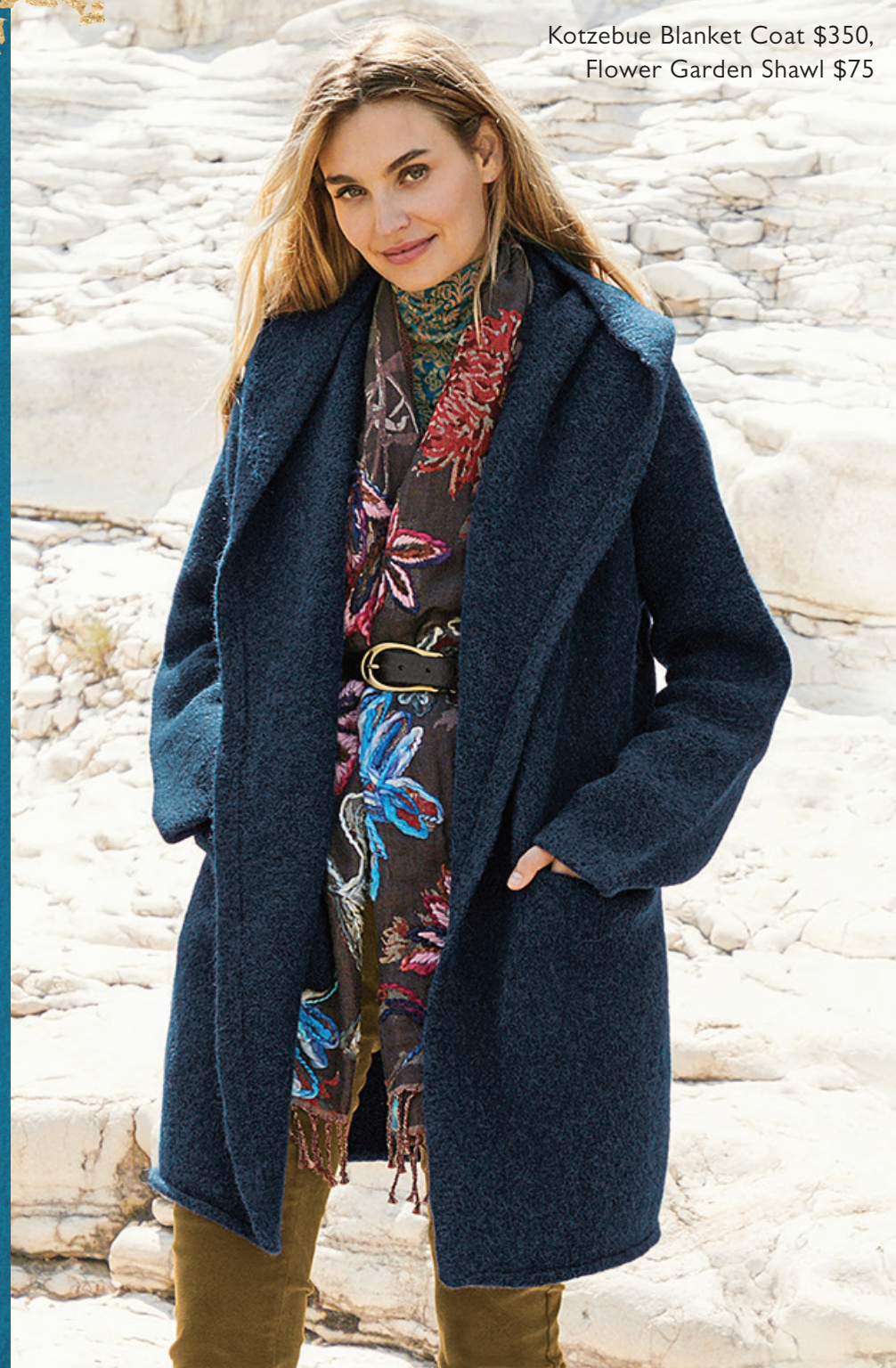
Kotzebue Blanket Coat $350, Flower Garden Shawl $75