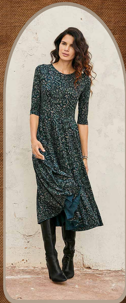
Sibyl Tapestry Dress $218