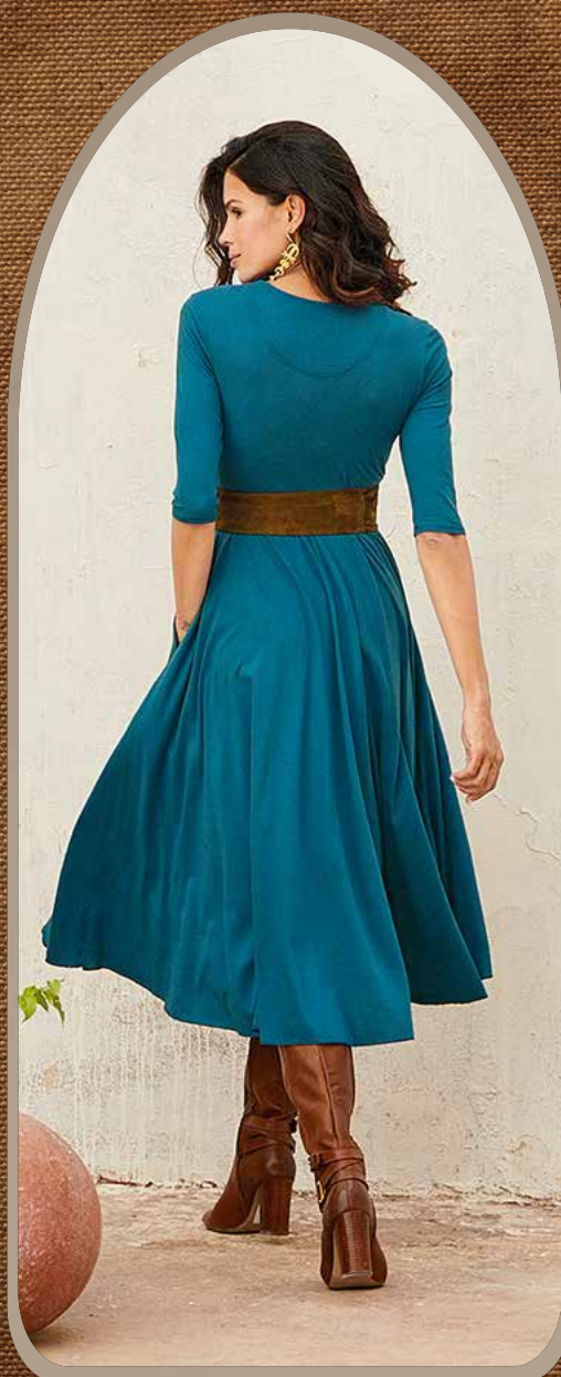
Sibyl Solid Dress $189 Suede Obi Sash $129

A customer favorite year after year, our ultra-flattering jersey dress now comes in three fabulous versions.