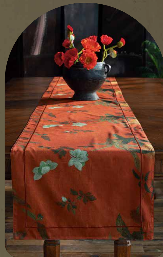
Hibiscus Table Runner $85-$125