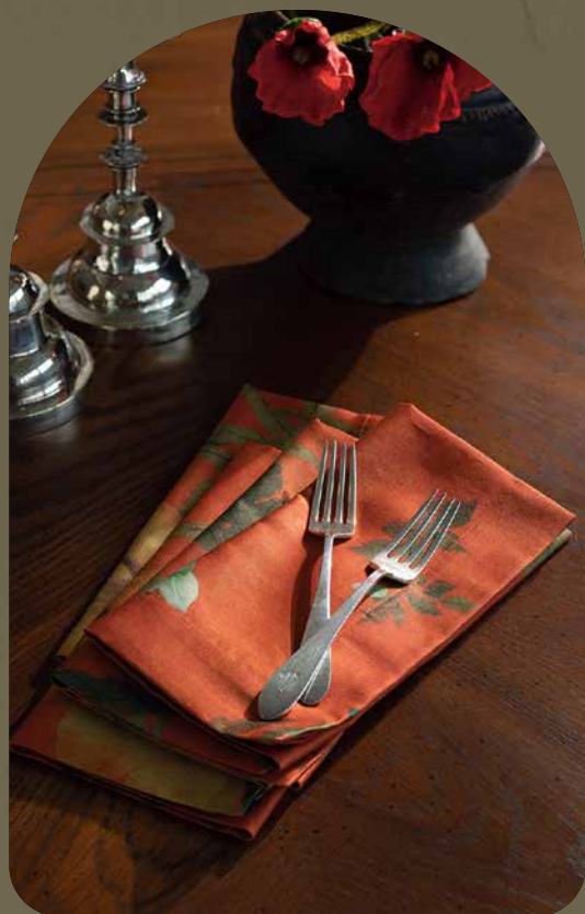
Hibiscus Napkins (Set of 4) $45

Add a touch of dramatic beauty to your seasonal gatherings.