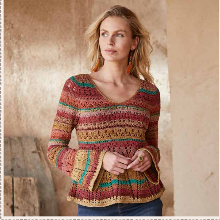
Zagora Top $598