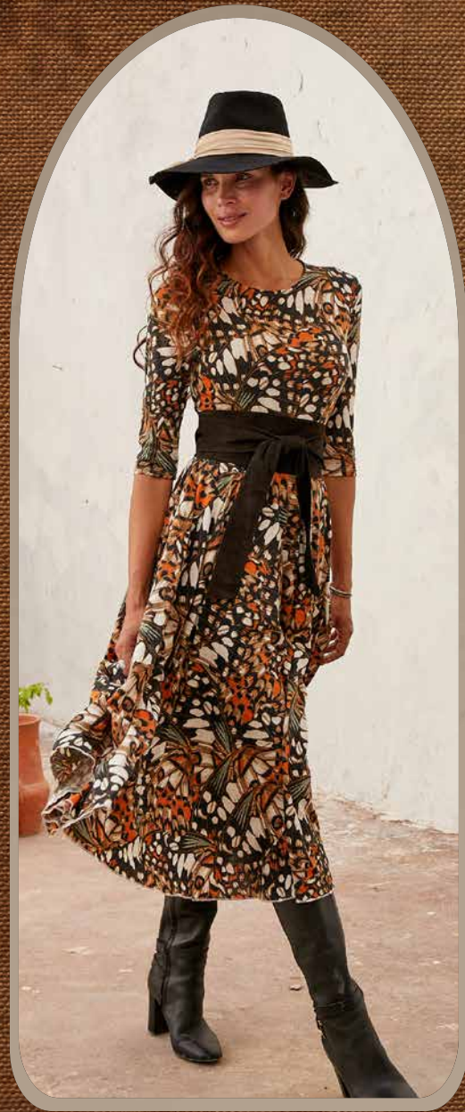
Sibyl Mariposa Dress $218 Chido Hat $169 Suede Obi Sash $129