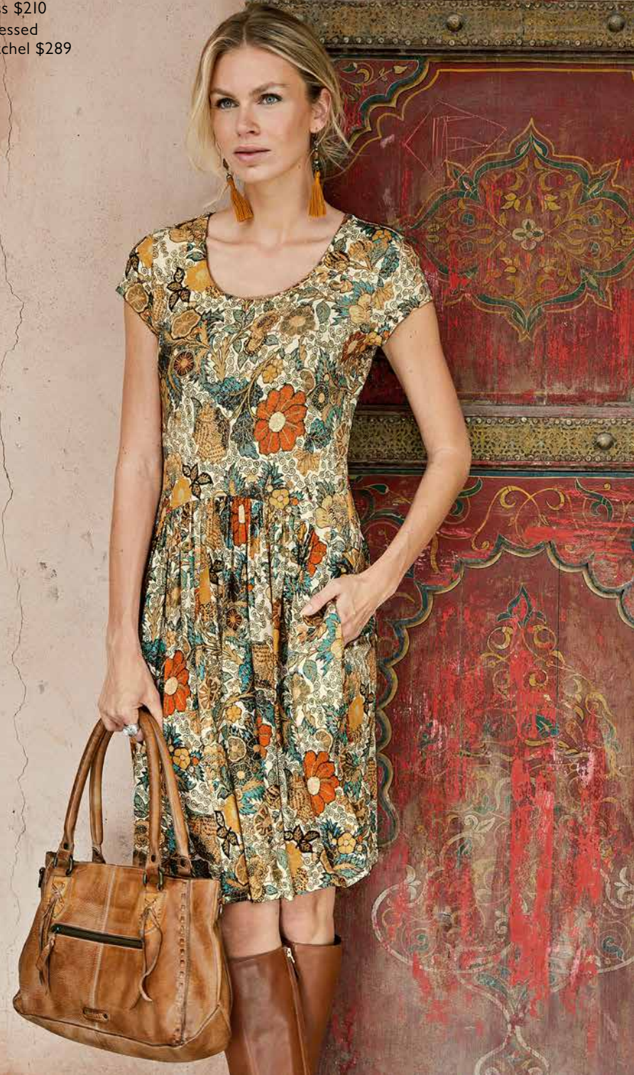
Akiko Dress $210 Small Distressed Leather Satchel $289

Spicy hues and inspired botanicals abound this season.