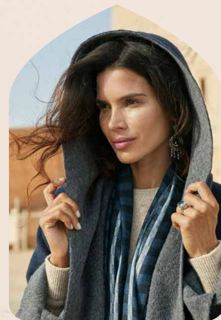
Blenheim Coat $798 (also in Black/Camel)