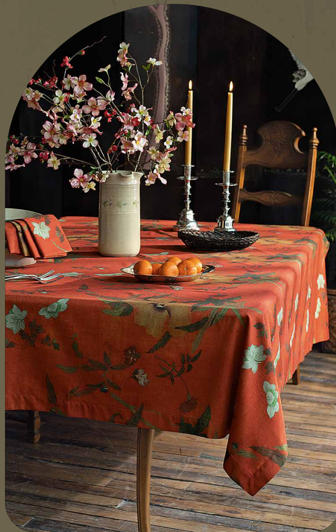
Hibiscus Tablecloth $95-$125