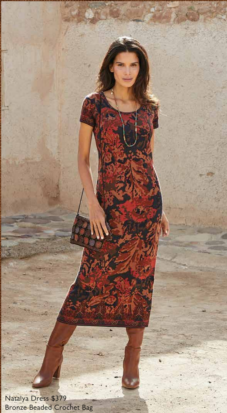
Natalya Dress $379 Bronze Beaded Crochet Bag

Relaxed and easy, yet always sophisticated, silhouettes.