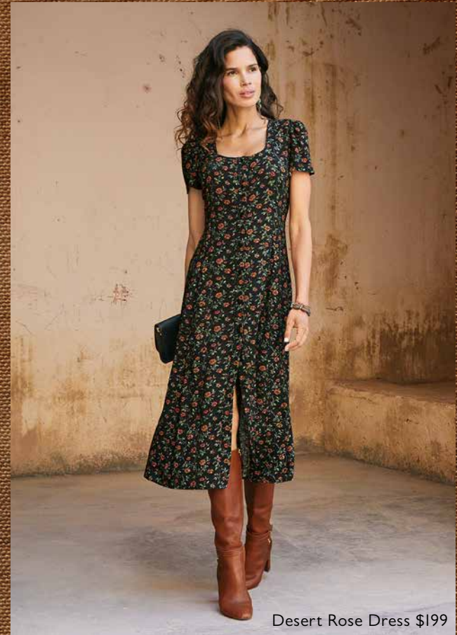
Desert Rose Dress $199