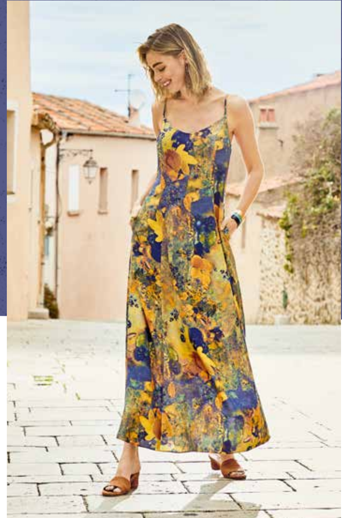
Saint-Rémy Slip Dress $269