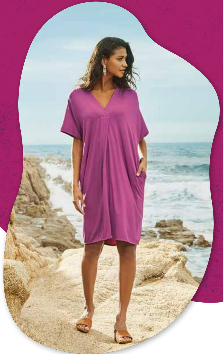
(Above) Short Thebes Dress $108 Flower Basket Earrings $129