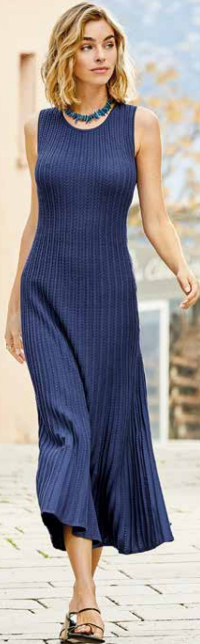
Delmara Dress $349

Our dresses aren't just designed, they're engineered.