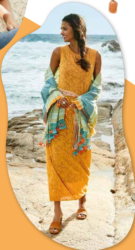
(Above) Portulaca Tee $88 Marigold Earrings $99