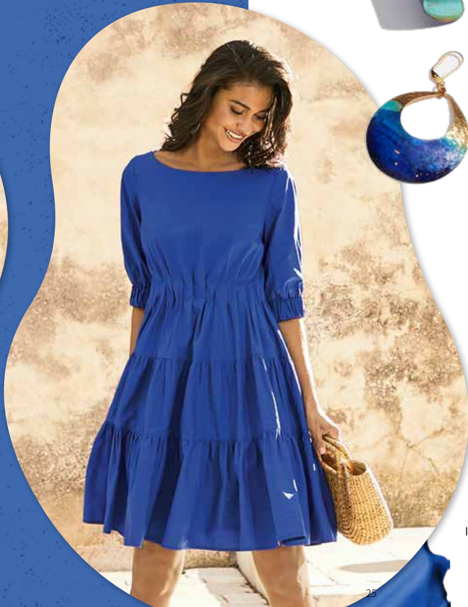
Eloise Dress $298 Issoria Cuff $99 Issoria Earrings $69