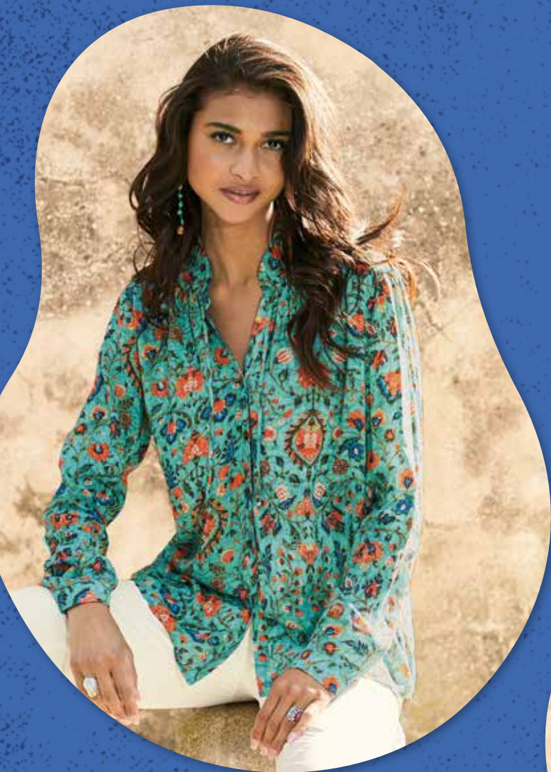
Chandra Shirt $298