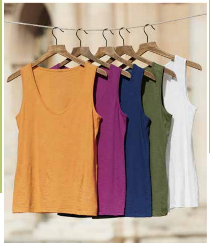
Easy Flamé Tank $49

Core closet essentials for wherever the season may take you.