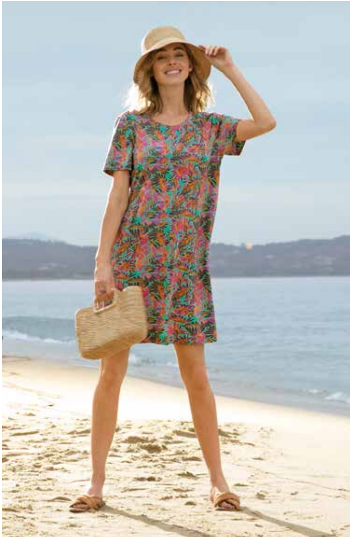
(Above) Paradiso Dress $99 Veracruz Bucket Hat $159 Chicama Bag $179