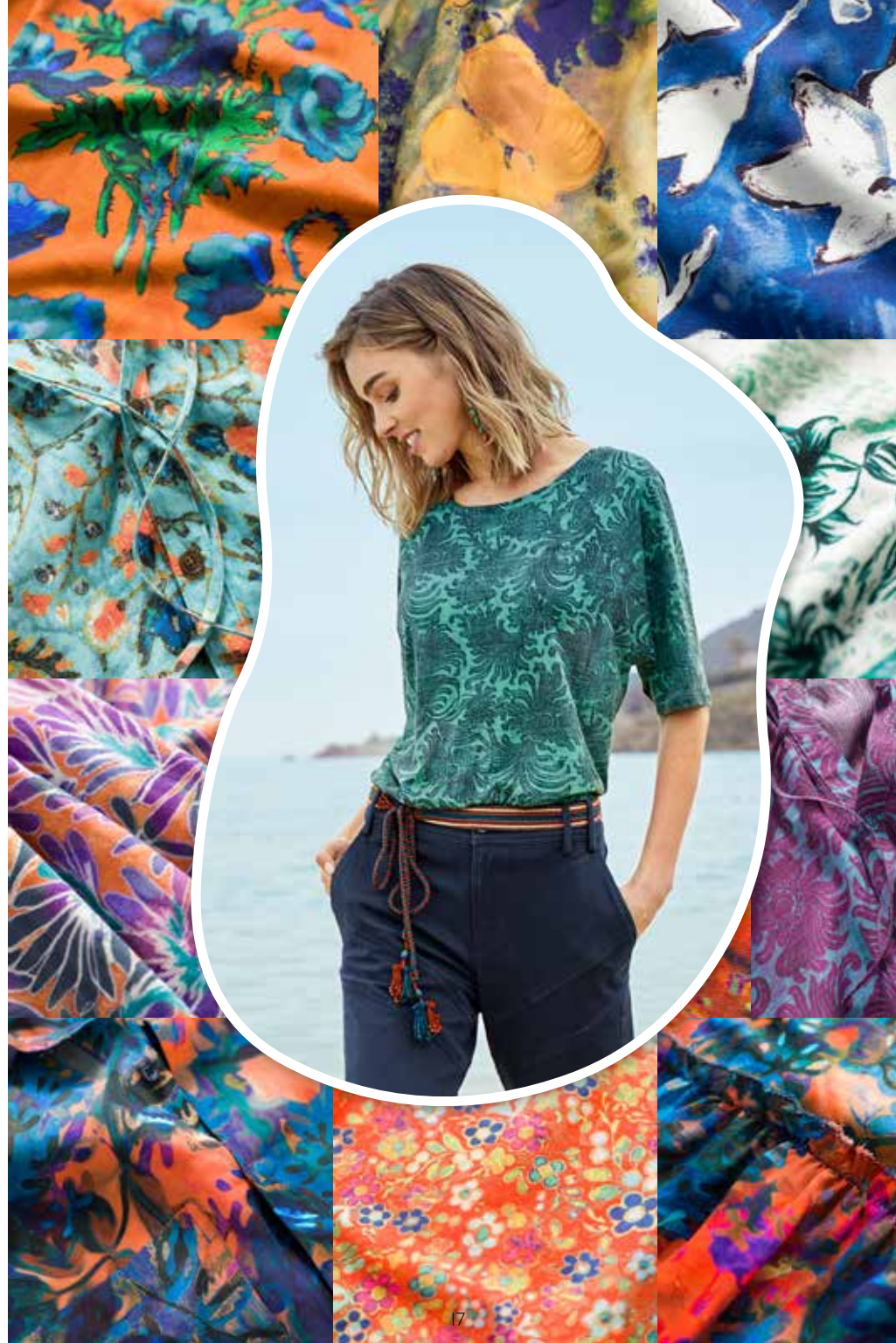
(Right) Reef Relaxed Tee $69