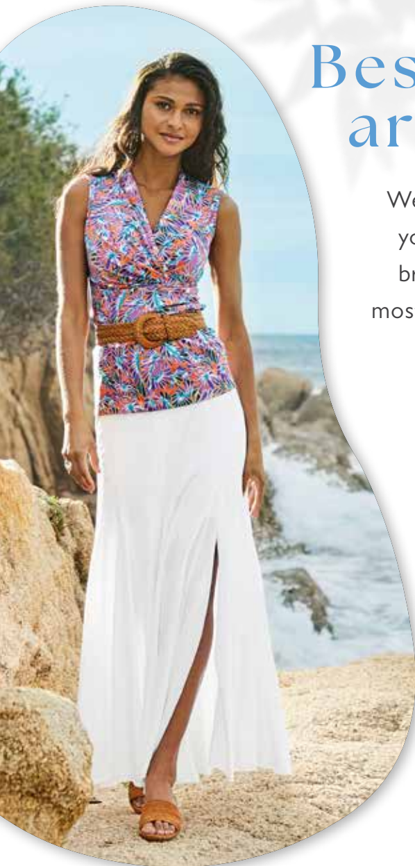
Paradiso Top $79 White Museo Skirt $129 Basketweave Belt $98

We've poured over your reviews and brought back our most loved silhouettes and fabrics.